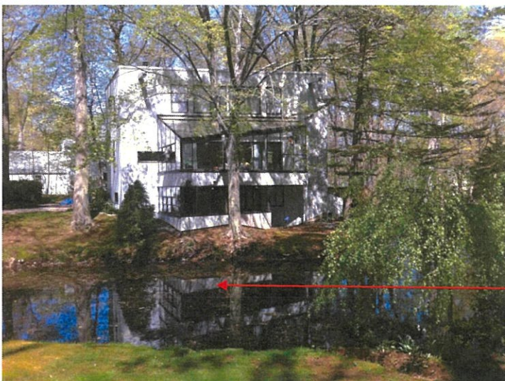
Image 3 Pond in Normal Condition