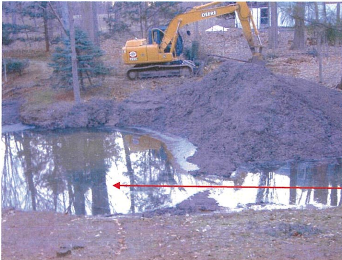
Image 4 Removal of silt by Town 2006