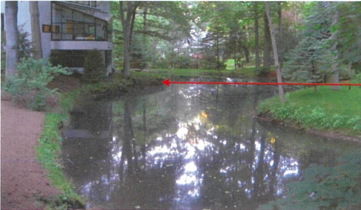
Image 1 Pond in Original Condition