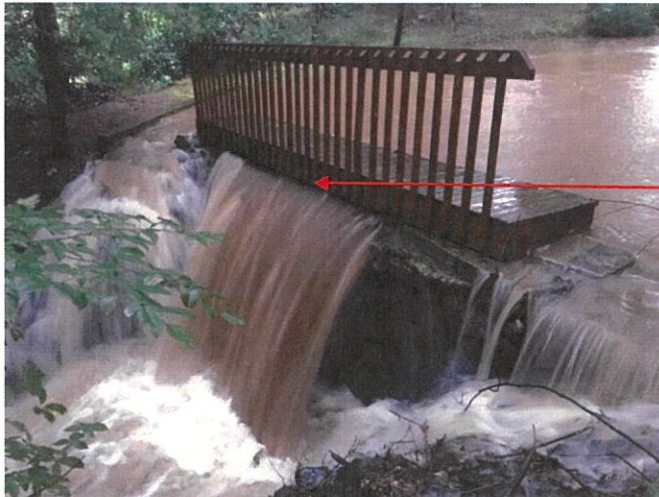
Image 8 Water flow over dam during heavy rain