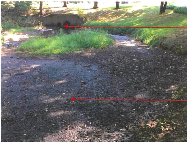
Image 5 Storm Drains to Pond