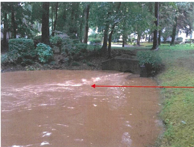
Image 9 Water flow from storm drains