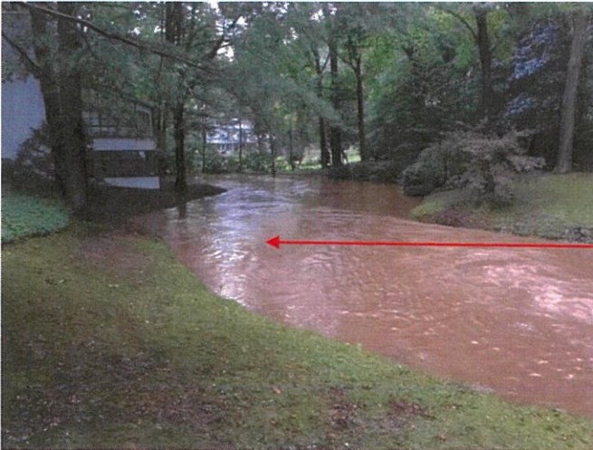
Image 7 Water flow during heavy rain